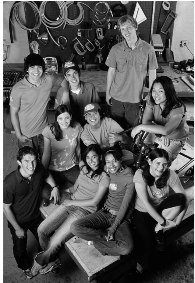
Two mechanical engineers host the show, leading the teenagers as they compete over the course of 13 episodes.

Design Squad features two teams of high school kids who use their problem-solving skills to design, construct, and test engineering projects such as a machine that automatically makes pancakes, or a motorized red wagon that can reach speeds up to 20 mph. The 8 teenagers will compete over 13 episodes, and all of them will be scored for their ability to think outside the box and meet the demands of each challenge. In the final episode, the top two scorers will battle for the Grand Prize—a $10,000 college scholarship provided by the Intel Foundation. Design Squad will premiere on PBS in February 2007. To learn more about this program, visit the Web site pbskids.org/designsquad .